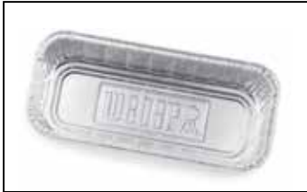
Summit® Drip Pan Made to the highest quality without any sharp edges. 6417 RRP $29.95