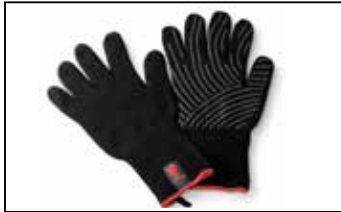
High Temperature Premium Gloves Handle hot pizza stones, hotplates and tools. L/XL - 6670 RRP $64.95 S/M - 6669 RRP $64.95