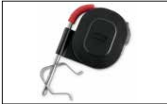
iGrill Ambient Probe This durable, stainless steel probe clips onto your grill to provide exact ambient temperature tracking. 7212 RRP $19.95