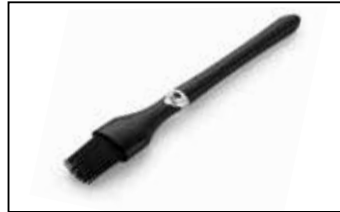
Silicone Basting Brush Removable silicone bristles are easy to clean and will not shed, stain or retain odours. 6661 RRP $24.95