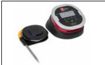
iGrill 2 Featuring a digital LCD display, total control of your barbecue meals has never been easier. 7203 RRP $149.95