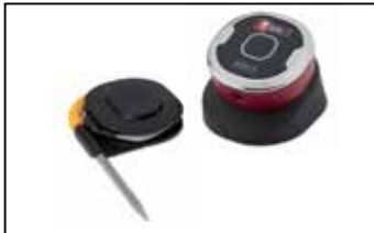
iGrill® mini Take the guesswork out of barbecuing with the iGrill Mini digital Bluetooth® thermometer. 7202 RRP $79.95