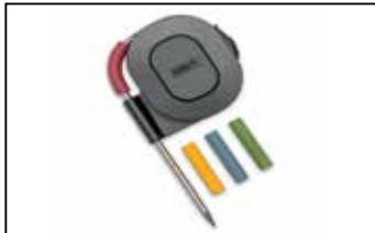
iGrill Probe Either replace an existing meat probe or add a couple more to your iGrill 2. 7211 RRP $19.95