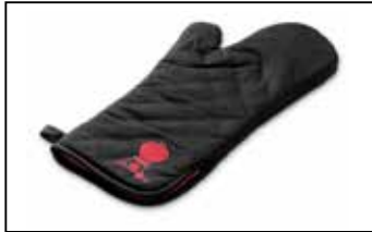
Barbecue Mitt Black with Kettle Motif Has a special flame retardant coating to protect you from the heat of your barbecue. 6532 RRP $21.95