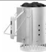
Rapidfire™ Chimney Starter

The easy way to get charcoal fired up and ready to use quickly. Ready to cook on in 20-25 minutes.