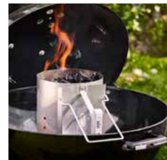
57 cm Kettle Rotisserie

For the Weber range of 57 cm kettles, features a heavy duty electric motor and a wooden handle.