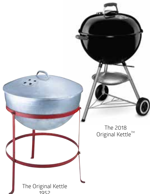
The 2018 Original Kettle™

For nearly 30 years we've recommended that our kettle owners buy 'The Complete Australian Barbecue Kettle Cookbook'. We know it ensures that you will become a master Weber kettle chef. That's why these days, not only do we recommend the book, we include it with all of our 57 cm kettles. It's our guarantee of your success. We think there's probably no better product handbook in the world.