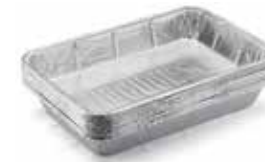
Large Drip Pan - Pack of 10

Especially designed for barbecue use. Made to the highest quality without any sharp edges.