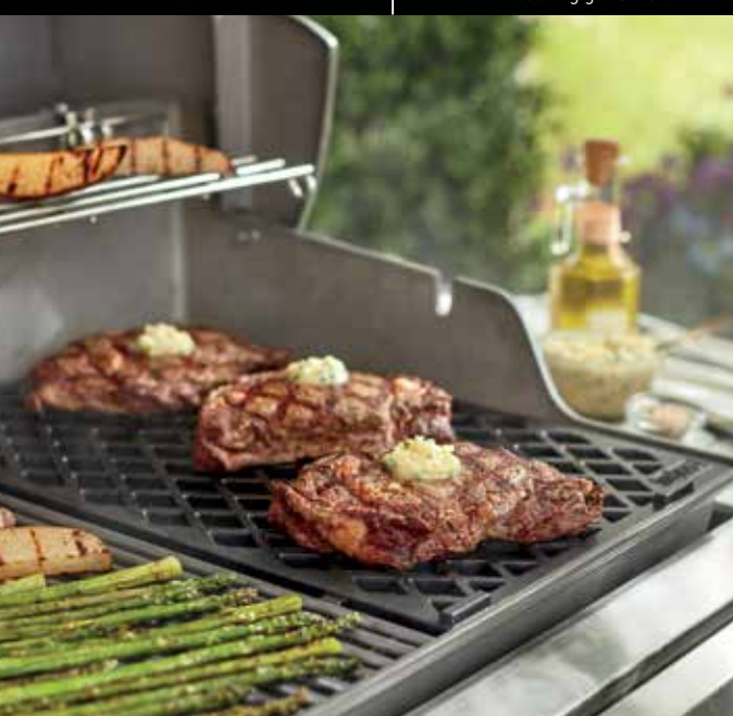
Genesis II Diamond Cooking Sear Grate Get professional sear marks while sealing in the moisture and flavour of your food.