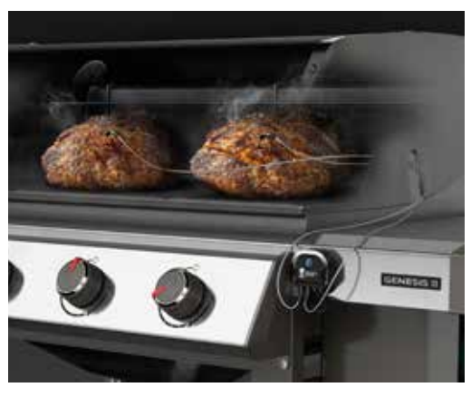
We grill, you grill, iGrill®

The fat management system in the Genesis II guides excess fat and debris away from the heat of the burners, into a disposable drip tray below the cooking area. This means fat won't build up near the burners, helping reduce the chance of a fat fire.